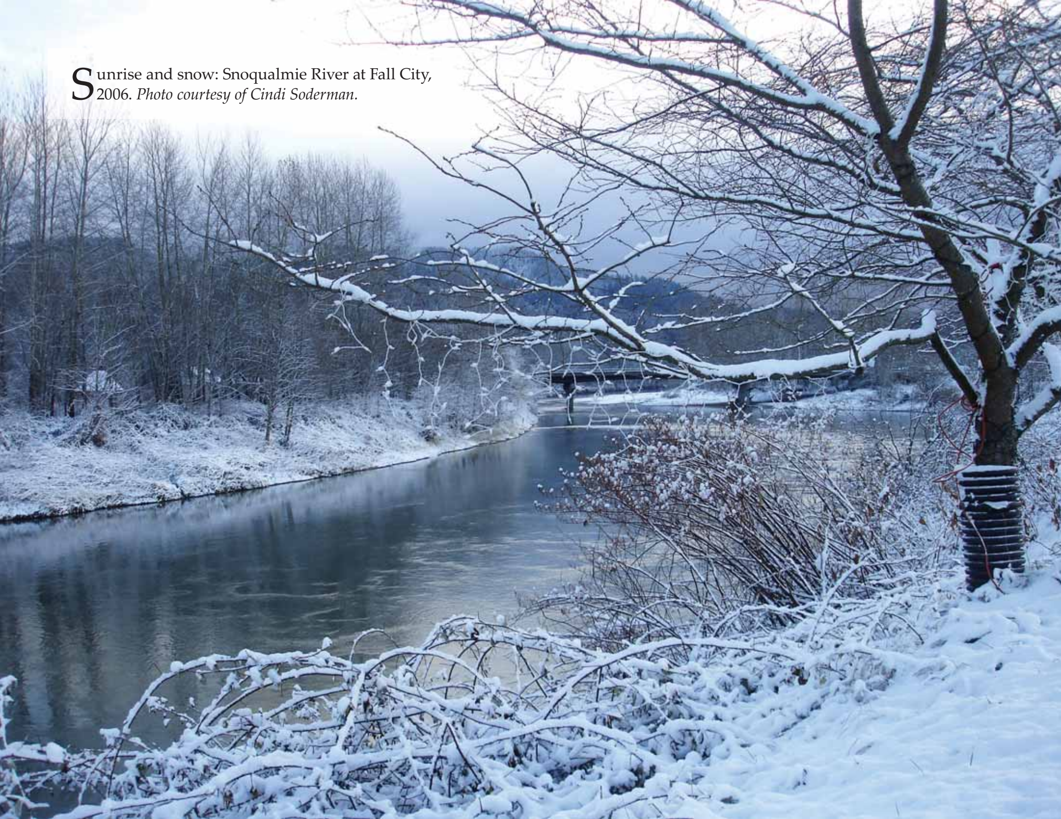
Sunrise and snow: Snoqualmie River at Fall City, 2006.