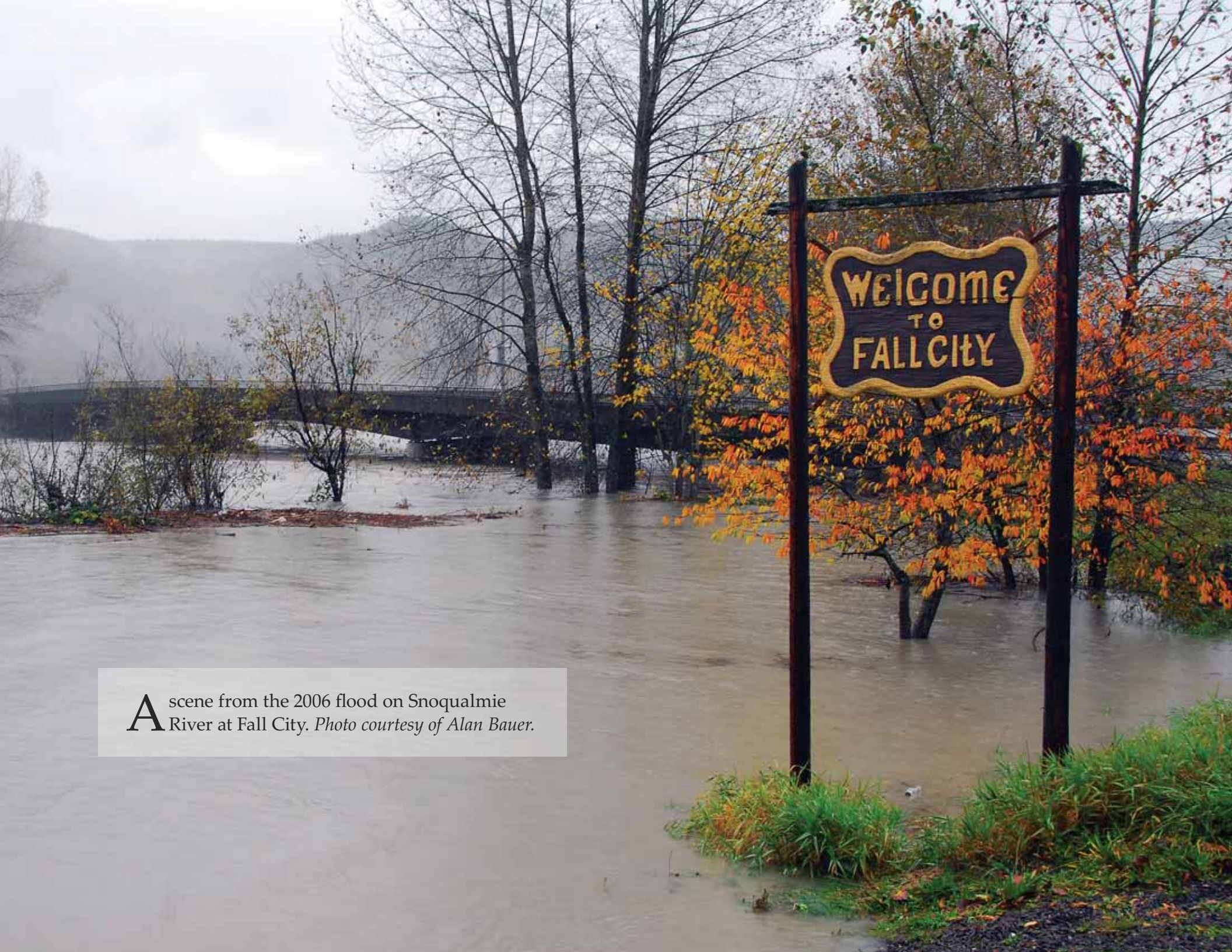
A scene from the 2006 flood on Snoqualmie River at Fall City.