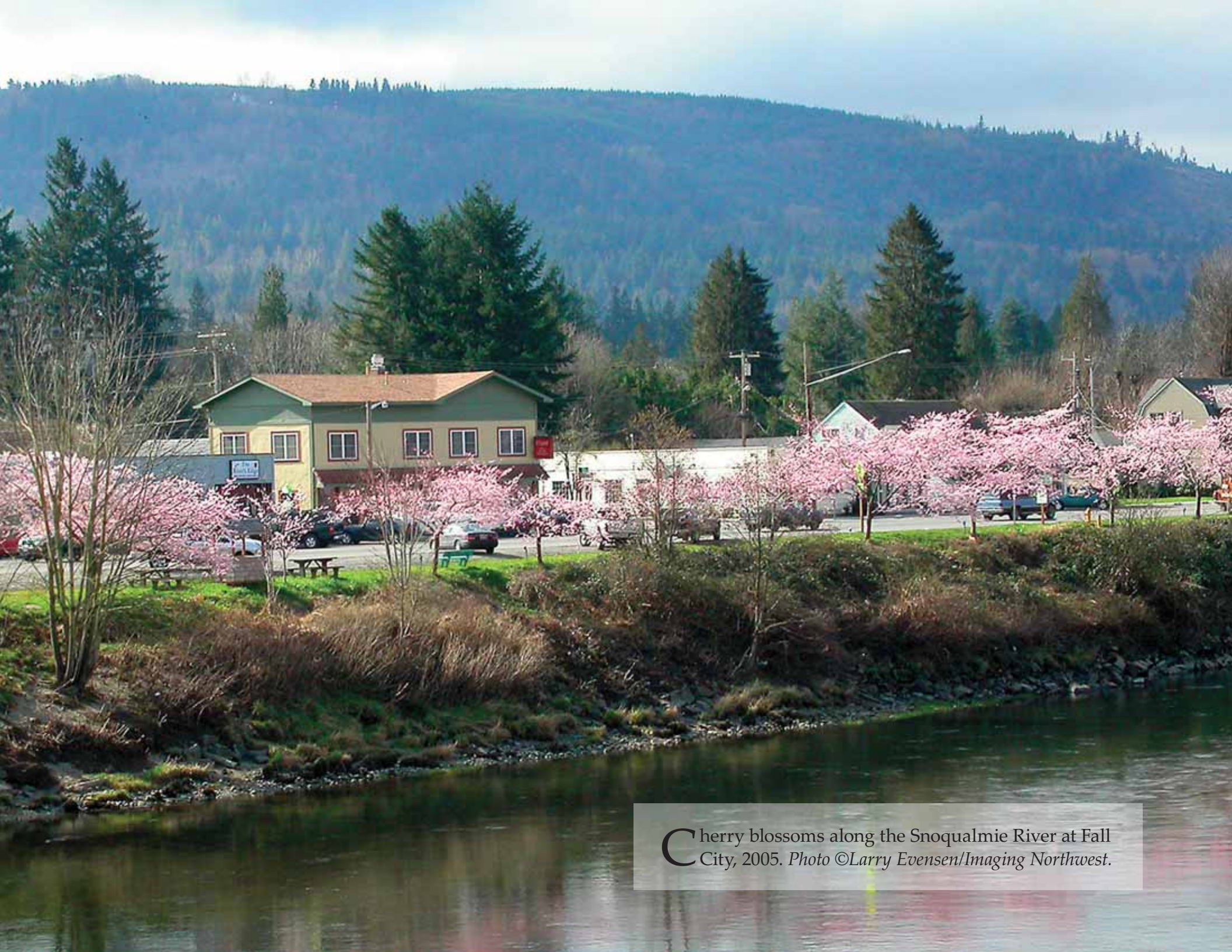
Cherry blossoms along the Snoqualmie River at Fall City, 2005.